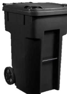
36-gal or Greater Plastic w/Wheels