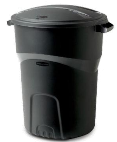
35-gal Maximum Plastic