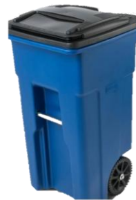
35-gal Maximum Plastic w/Wheels